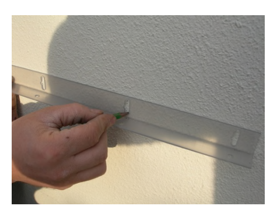
4. Mark wall bracket fixing points