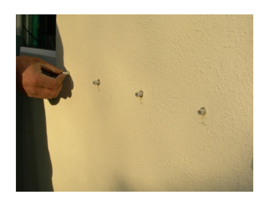
6. Insert wall anchors