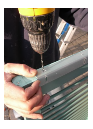
2. Drill pilot holes for fixing screws