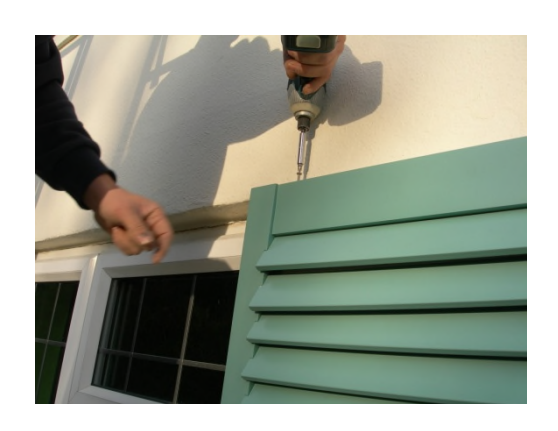
10. Insert screws to secure shutter to top bracket