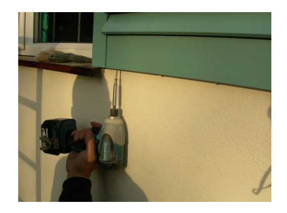
9. Insert screws to secure shutter to bottom bracket