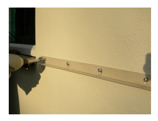
7. Secure bottom bracket to wall firmly (use washers supplied-not shown)